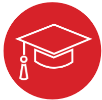
Education and Knowledge

The main strategic priorities are arranged under sections related to the Vice Presidents leadership structure (VPs) which are: Education and Knowledge, Science, Workforce and Services. The other priorities come under 'Internal' and 'Public/ Patient Engagement' to improve health.